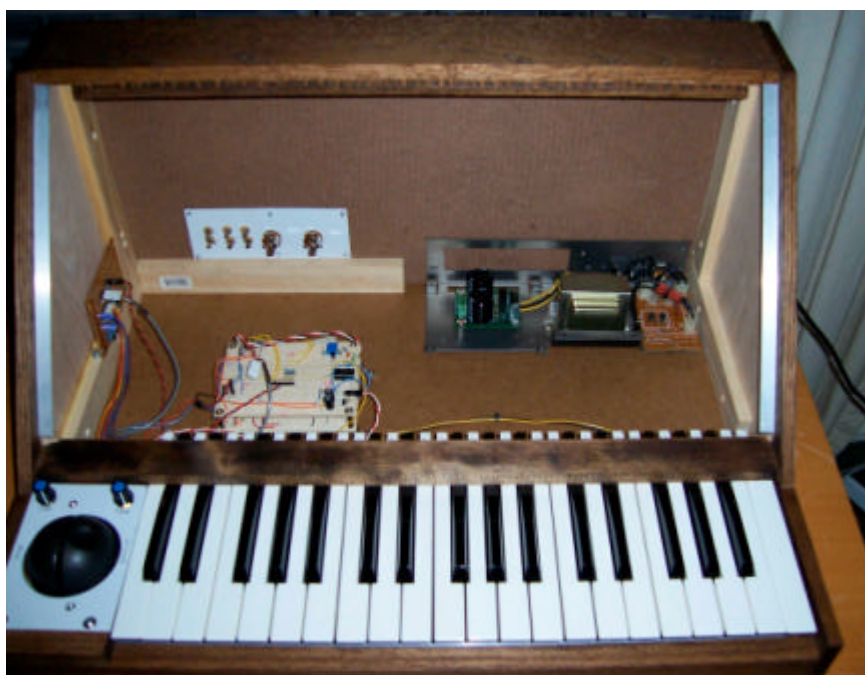
The wooden cabinet with power supply and keyboard controller ready to take the front panel.