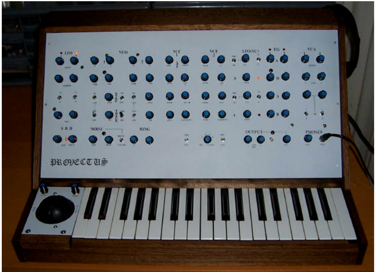
The finished unit.